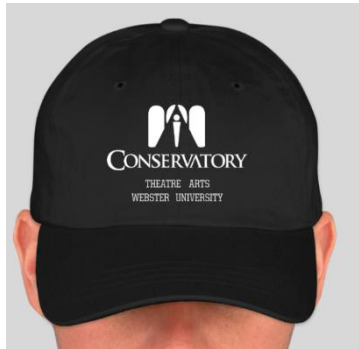
BASEBALL CAP PRICE: $5 INFO: 100% Polyester. 'Alum' written on back