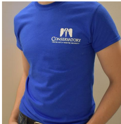
BLUE "PROS" SHIRT PRICE: $5 SIZES: S-2XL

GET YOUR T-SHIRT HAND TIE DYED FOR JUST $5 MORE!