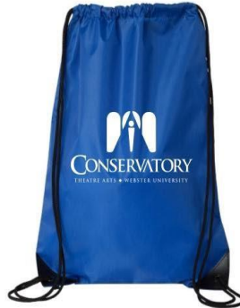
DRAWSTRING BAG PRICE: $5 INFO: Nylon. Black Cord Drawstrings. 14" x 18"