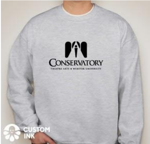
GRAY SWEATSHIRT PRICE: $30 SIZES: S-XL