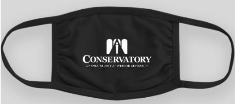
BLACK FACE MASK PRICE: $10

All profits from the face masks will help fund a scholarship for BIPOC Conservatory students.