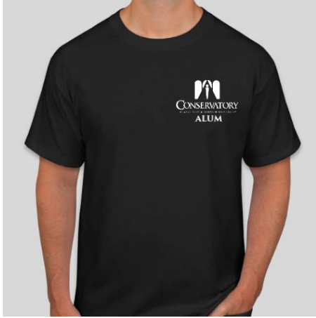
ALUM SHIRT PRICE: $5 SIZES: S-2XL