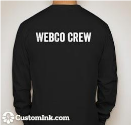
CREW LONGSLEEVE PRICE: $15 SIZES: S-XL