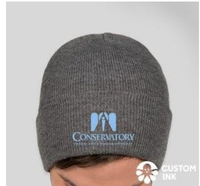
GRAY BEANIE PRICE: $5 INFO: 100% Acrylic Knit. 3" folding cuff.