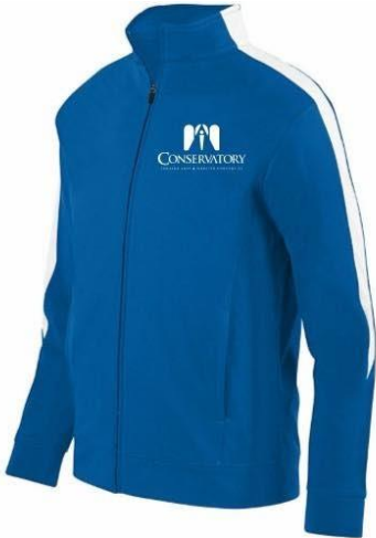
BLUE TRACK JACKET PRICE: $30 SIZES: S-2XL

All profits support the 2021 Final Senior Showcase, unless otherwise specified.