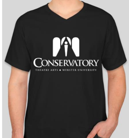
BLACK V-NECK PRICE: $5 SIZES: S-2XL