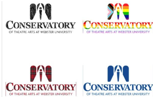
PAGE OF 4 SMALL STICKERS PRICE: $4 INFO: Designs include marbled black, Pride/BLM flag, plaid, & blue! 1.7" x 4"