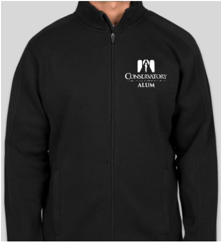
BLACK ALUM JACKET PRICE: $15 SIZES: M-2XL