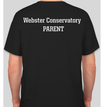
PARENT SHIRT PRICE: $5 SIZES: S-XL