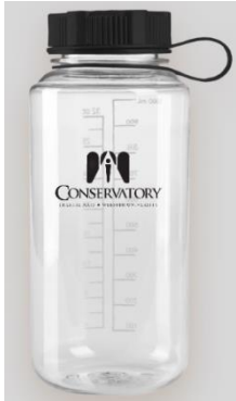
WATER BOTTLE PRICE: $5 INFO: Plastic bottle with screw on lid. Holds 32oz.