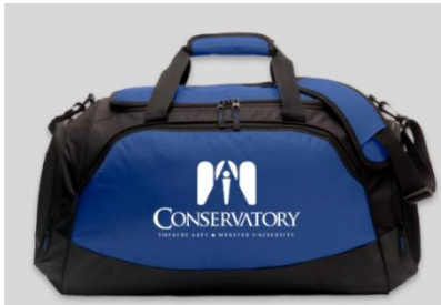
DUFFLE BAG PRICE: $10 INFO: Polyester Canvas 15" H x 29" W x 13.25" D